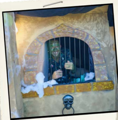
The winning boot!