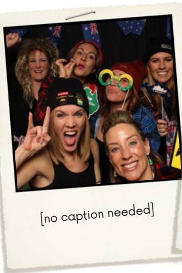
[no caption needed]