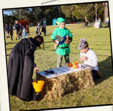
Halloween Tic Tac Toe