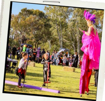
Stilt walker with little circus performers