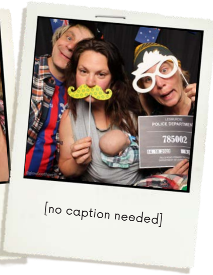
[no caption needed]