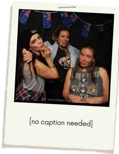
[no caption needed]

Have a look and a laugh at our Bogan Bingo evening