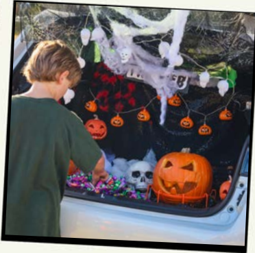
Trick or Treating

The pictures speak for themselves... Our inaugural Trunk or Treat was a huge success! Thanks to our parent volunteers. We could not have run this without you.