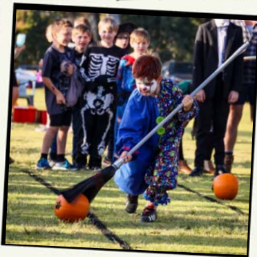
Witches Broom Race