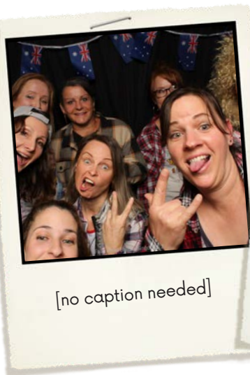
[no caption needed]