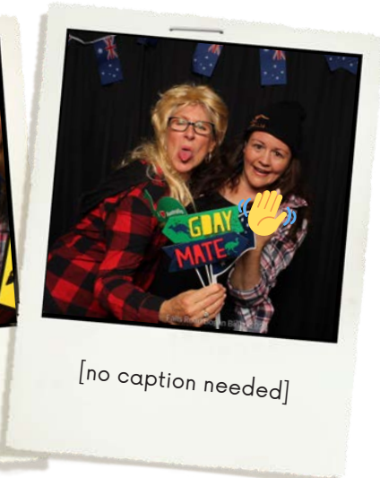
[no caption needed]