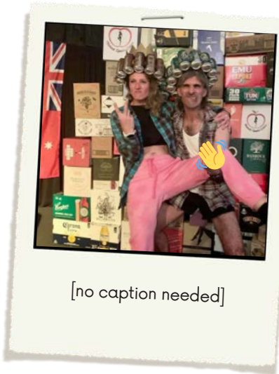
[no caption needed]